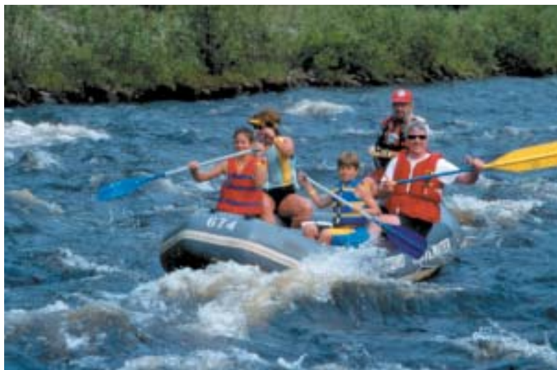
The Lehigh River's changeable character provides thrills, as well as tranquility. Some of the best white-water rafting in the East can be found on the upper Lehigh River.

Six whitewater outfitters are located in the watershed. These outfitters include Lehigh Rafting Rentals in White Haven, Lehigh Gorge Outfitters in White Haven, Whitewater Challengers in White Haven, Whitewater Rafting Adventures in Nesquehoning, Jim Thorpe River Adventures in Jim Thorpe and Pocono Whitewater Adventures in Jim Thorpe. Continually updated information regarding rafting, kayaking, and canoeing trips, rentals and instruction, whitewater conditions and other information can be obtained by contacting the individual outfitters.