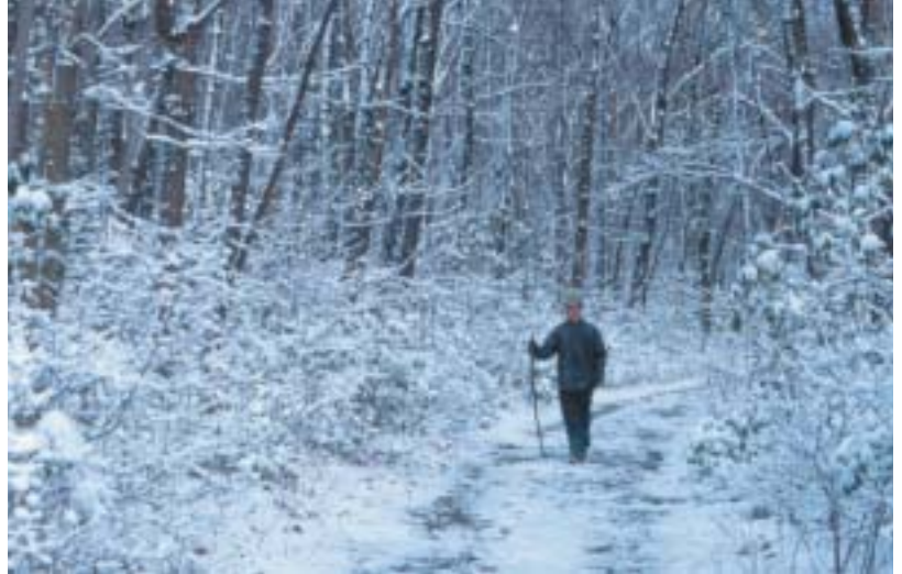
The world-famous, 2,160-mile Appalachian Trail slices through the eastern portion of the state on the Blue Mountain from the Delaware Water Gap to the Maryland line, and provides access to some of the commonwealth's most beautiful vistas.

Detailed maps of these and all segments of the Appalachian Trail can be obtained by contacting the Appalachian Trail Conference. The Appalachian Trail Conference is a volunteer-based organization dedicated to the preservation and management of the natural, scenic, historic, and cultural resources associated with the Appalachian Trail, in order to provide primitive outdoor-recreation and educational opportunities for trail visitors. (Appalachian Trail Conference web site 2003)