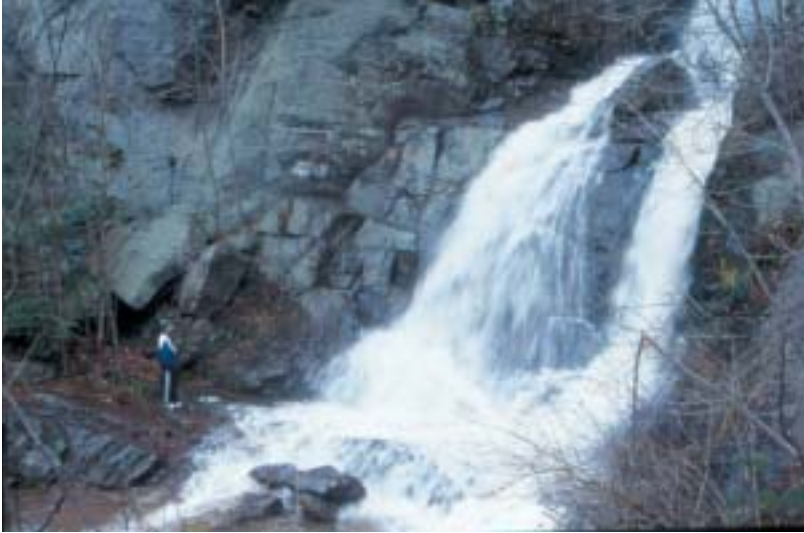
When there is an abundance of ground and surface water, waterfalls can be found throughout the Lehigh Gorge.

Mountain in north Georgia. The trail traverses Maine, New Hampshire, Vermont, Massachusetts, Connecticut, New York, New Jersey, Pennsylvania, Maryland, West Virginia, Virginia, Tennessee, North Carolina, and Georgia. Day, weekend and other short-term hikers, section hikers and thru-hikers use the Appalachian Trail (A.T.). Thru-hikers hike the entire length of the Trail in one season. (United States Department of the Interior, National Park Service web site. 2003).