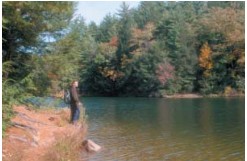
The state's park at Beltzville covers nearly 3,000 acres, and surrounds the U. S. Army Corps of Engineer's 970-acre flood-control dam and lake.

Portions of two of Pennsylvania's total of 20 state forests are located within the Lehigh River watershed. These state forests include Weiser State Forest (19,200 acres) in Dauphin, Carbon, Schuylkill and Berks Counties, and Lackawanna State Forest (8,400 acres) in Lackawanna and Luzerne Counties. A description of the recreational activities available within each of these state forests is provided below in Table 6-1.