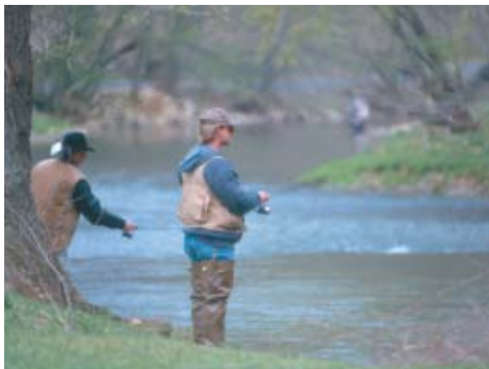
People come from other states to join locals who fish the Lehigh and its tributaries for prize-winning wild trout.

The Lehigh River and its tributaries offer year-round opportunities for public fishing for several species of warm-water, cool-water and cold-water fish. The Pennsylvania Fish and Boat Commission is the primary state agency responsible for managing fisheries and for developing and enforcing fishing and boating regulations within the Commonwealth of Pennsylvania. The agency's goals are to protect, conserve and enhance aquatic resources, provide for the protection of aquatic resource users, address the expectations of anglers and boaters, and advocate the wise, safe use of Pennsylvania's aquatic resources. Popular game fish found within the Lehigh River watershed are listed in Table 6 – 3.