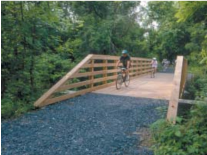
Among a growing number of rail-trail conversions in the country, the Ironton Rail-Trail is popular, accessible, and well-maintained.

Rail-trails are a perfect means of telling community stories. Their long and colorful history make perfect greenways. They combine that history with a respect for the environment, and recreation, and allow us to live life on a human scale, maintaining contact with each other and with nature.