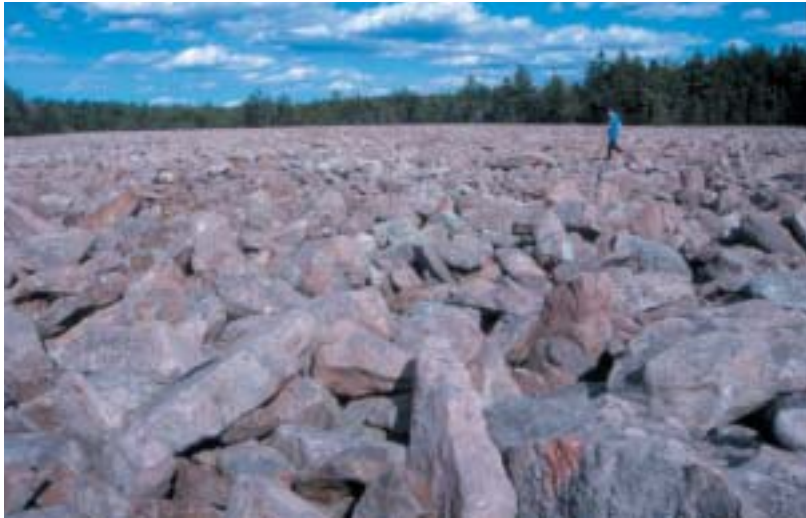
This remarkable boulder field was left when rock-bearing glaciers melted 20,000 years ago. Today, it is a National Natural Landmark.

A map depicting the spatial distribution of state forests within the Lehigh River watershed can be found in Map 6-1. Detailed maps of individual state forests and continually updated information regarding trails and other recreational activities available at these forests can be obtained by contacting the Pennsylvania Department of Conservation and Natural Resources, Bureau of Forestry.